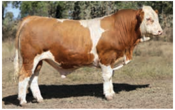
LOT 17 | MELDON PARK U233 (P)