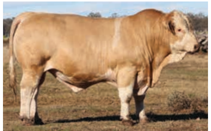
LOT 53 | MELDON PARK U158 (P)