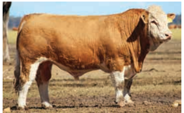
LOT 9 | MELDON PARK U111 (P)