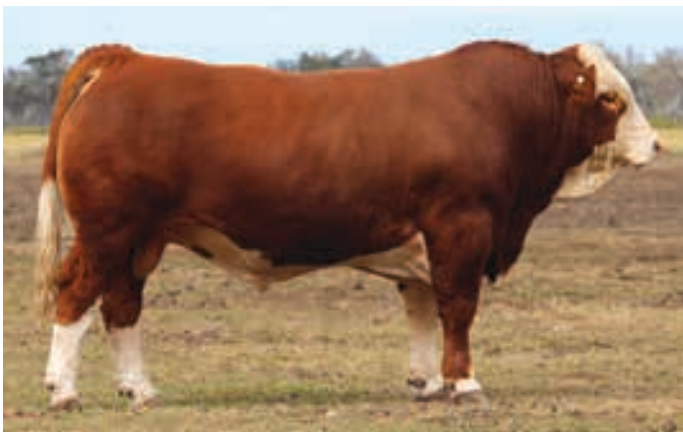
LOT 69 | MELDON PARK U176