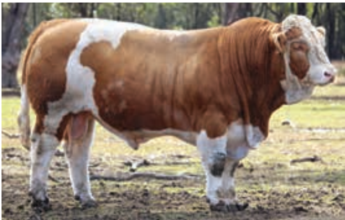
LOT 6 | MELDON PARK U230 (P)