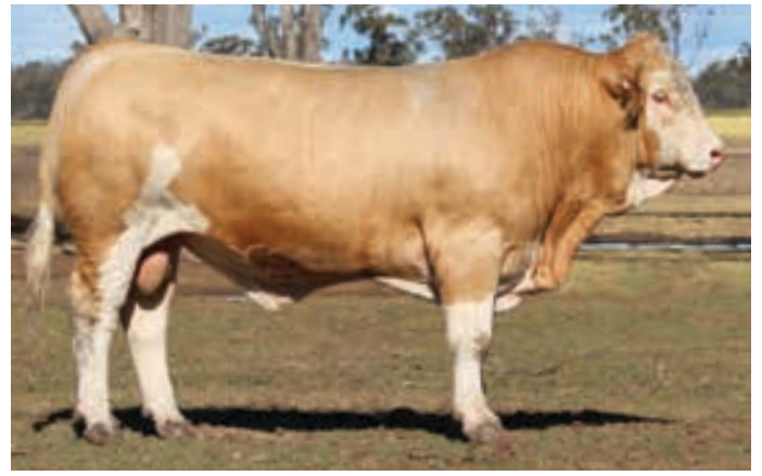
LOT 39 | MELDON PARK U204 (P)