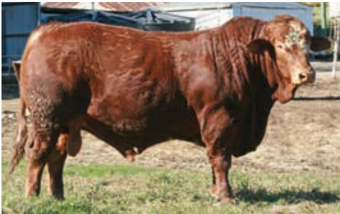
LOT 36 | NAVILLUS PARK V09 (P)