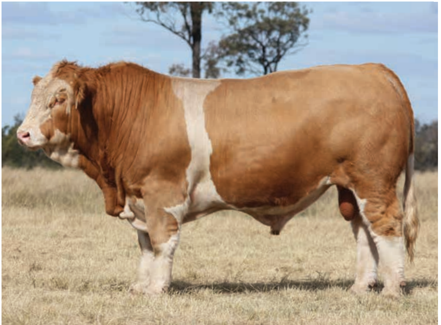
CASA TORO SET THE STANDARD