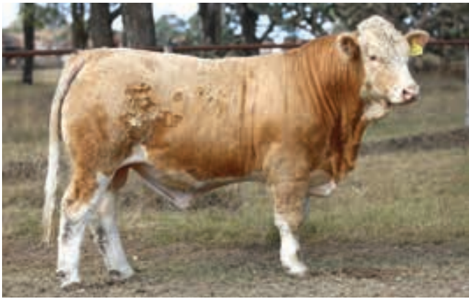
LOT 38 | MELDON PARK U258 (P)