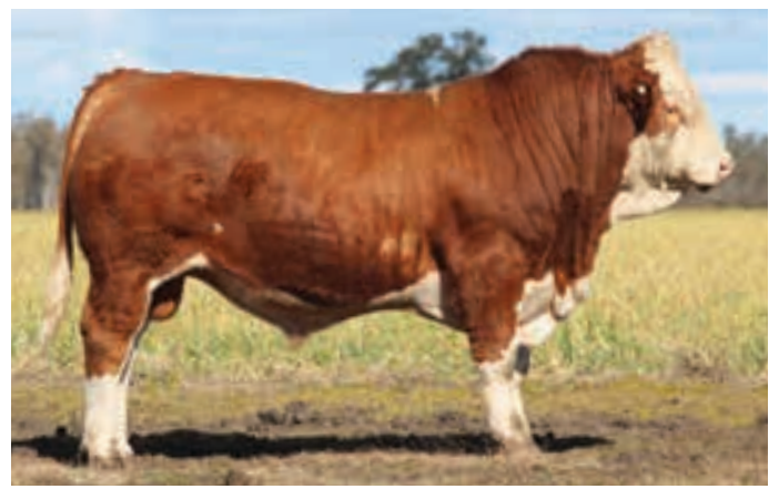
LOT 2 | MELDON PARK U228 (P)