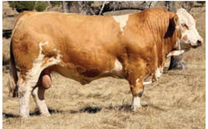
LOT 30 | K.B.V. UTENSIL (P)