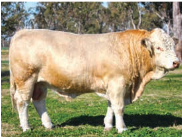
LOT 3 - Meldon Park Ted (P) 2024 SALE EQUAL TOP PRICED BULL, $18,000

Our Beef 24 Champion Meldon Park Stamp Duty is busy at home on stud duties. The first drop of weaners has exceeded all our expectations.