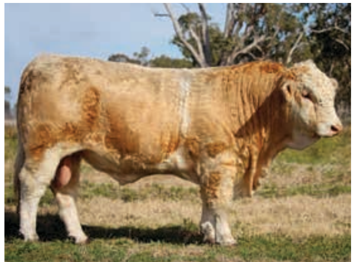
LOT 4 - Meldon Park Talk the Talk (P) 2024 SALE EQUAL TOP PRICED BULL, $18,000