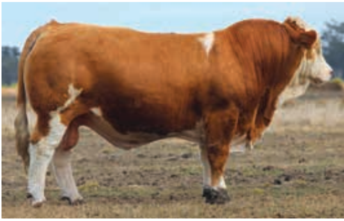
LOT 10 | MELDON PARK U245 (P)