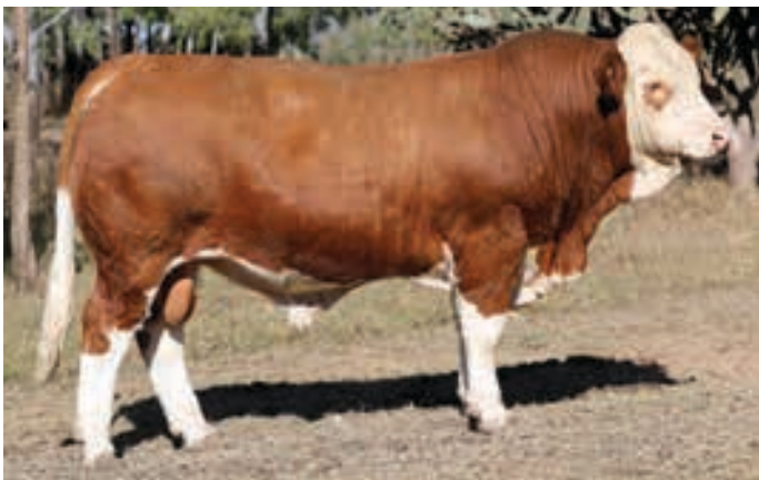
LOT 8 | MELDON PARK U272 (P)