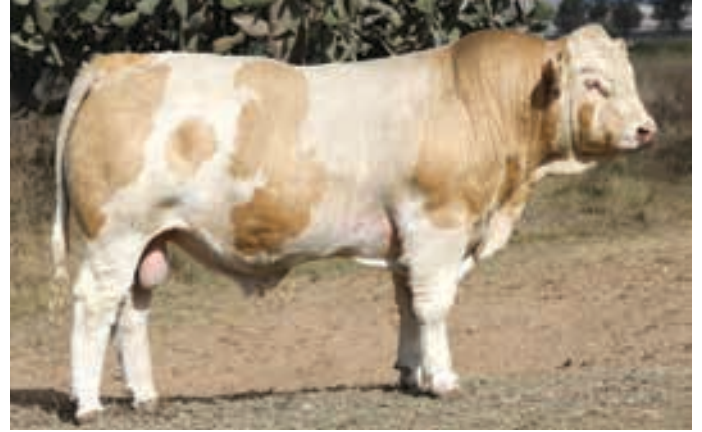
LOT 44 | MELDON PARK U273 (P)