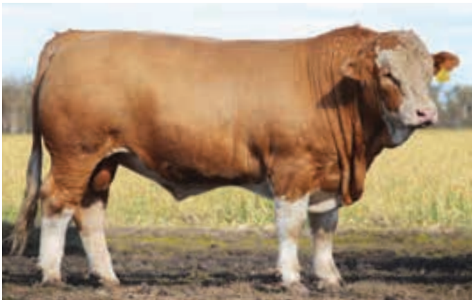
LOT 1 | MELDON PARK U214 (P)