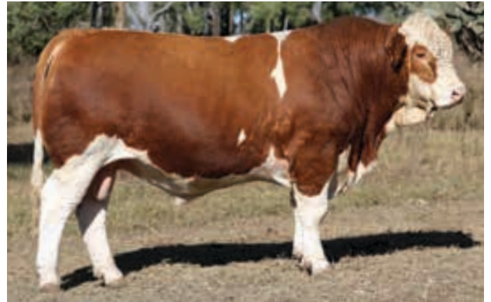
LOT 5 | MELDON PARK U217 (P)