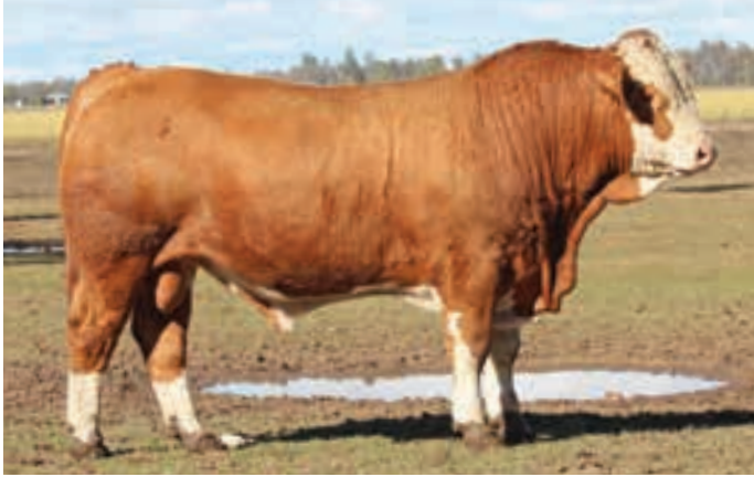
LOT 41 | MELDON PARK U223