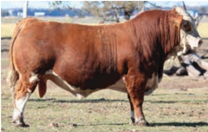
LOT 26 | MELDON PARK U178