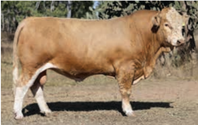
LOT 3 | MELDON PARK UNDER WRAPS (P)