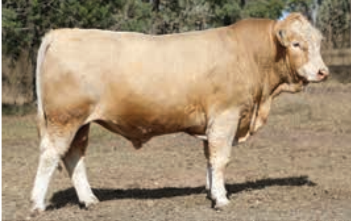
LOT 21 | MELDON PARK W ULTIMATE (P)