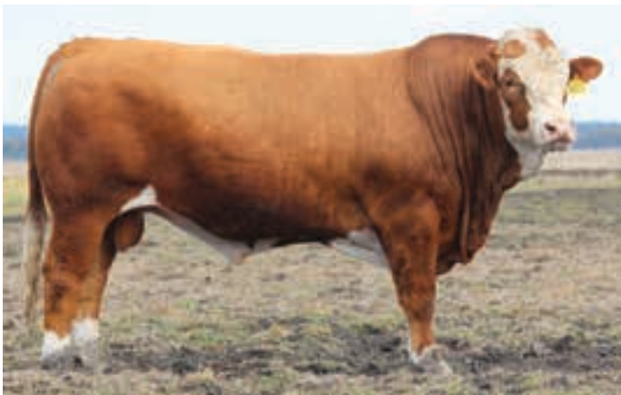
LOT 52 | MELDON PARK U175 (P)