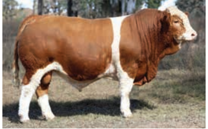
LOT 25 | MELDON PARK U250