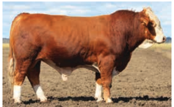
LOT 76 | MELDON PARK U113 (P)