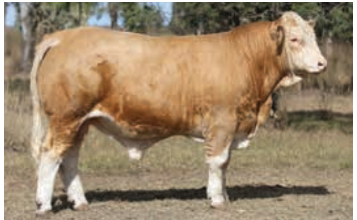
LOT 37 | MELDON PARK U220 (PP)