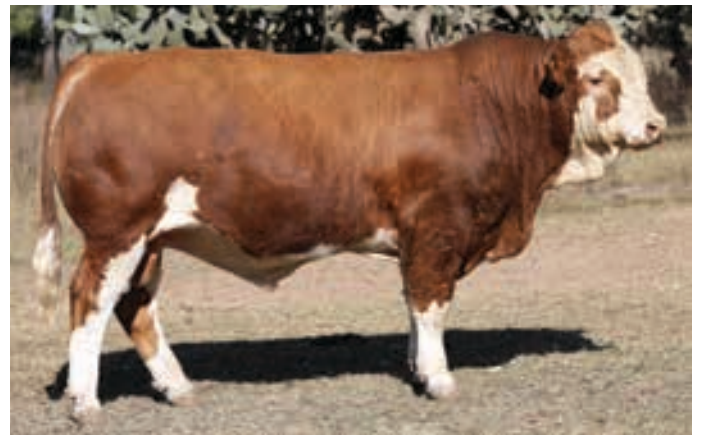
LOT 7 | MELDON PARK U162 (P)